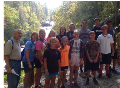
Hiking in DuPont State Forest